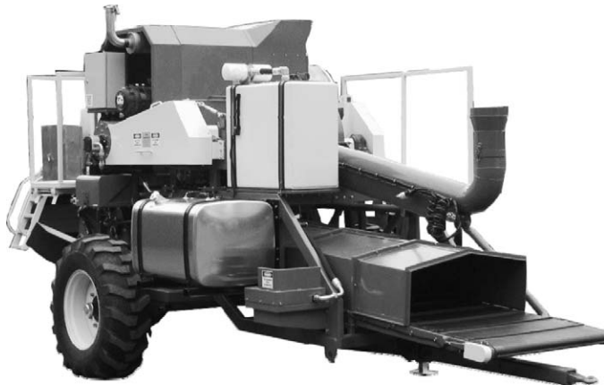
Figure 4. First commercially available Harrington Seed Destructor

Narrow windrow burning. The simple but effective narrow windrow burning system is currently the most widely adopted HWSC system in Australia. This inexpensive system uses a grain harvester mounted chute to concentrate all of the exiting chaff and straw residues into a narrow-windrow (500 to 600mm) (Figure 2a). These narrow windrows are subsequently carefully burnt under the right environmental conditions, avoiding burning the entire crop field (Figure 2b). The concentration of chaff and straw residues increases the duration and temperature of burning, creating the highest potential for weed seed destruction. Weed seed kill levels of 99% for both annual ryegrass and wild radish have been recorded from the narrow windrow burning of wheat, canola, and lupin ( Lupinus angustifolius L.) chaff and straw residues (Table 1, Walsh and Newman 2007). The simplicity and low cost of this narrow-windrow system has resulted in its adoption by an estimated 70% of crop producers in the major grain production state of Western Australia.