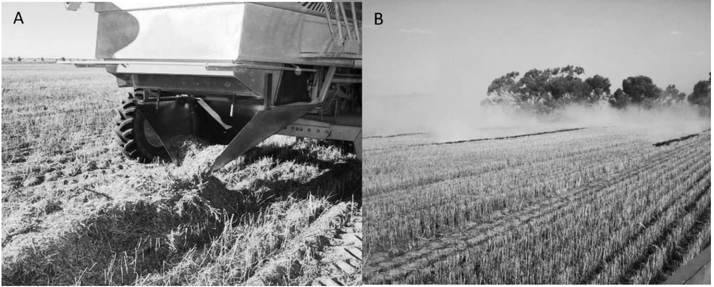
Figure 2 a) Chaff chute mounted on the rear of a harvester to form narrow windrows during harvest. b) Burning narrow windrows in wheat stubble in autumn (March to April)

Smith 1975). The biological attribute of seed retention at maturity in annual ryegrass, wild radish, and several other annual crop weed species, means that seeds are attached to the upright plant enabling the weed seeds to be collected (harvested) during grain crop harvest. For example, in field crops a large proportion (up to 80%) of total annual ryegrass seed production can be collected during a typical commercial grain harvest (Walsh and Powles 2007). These weed seeds enter the front of the grain harvester, are processed, and exit the grain harvester in the chaff fraction. An irony is that these “harvested” weed seeds are evenly redistributed across the crop field to become future weed problems. Thus, grain crop harvest presents an opportunity to target weed seed production, thereby minimizing replenishment/increase of the weed seedbank. As outlined below, harvest weed seed control (HWSC) systems have been developed in Australia to target and destroy weed seeds during commercial grain crop harvest, minimizing weed seed inputs into the seedbank (Walsh and Powles 2007).