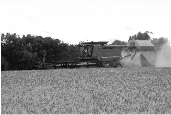
Figure 1. Chaff cart system in operation during commercial wheat crop harvest.

how a major herbicide-resistant weed problem has been the catalyst for the development of new non-chemical weed control techniques focused on weed seed capture and destruction during commercial grain crop harvest. We illustrate how the inclusion of these techniques in weed control programs allows weed populations to be driven to and maintained at very low levels. Finally, we speculate on the potential for at-harvest weed seed targeting technologies in global field crops.