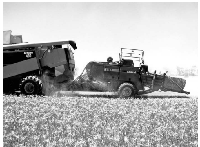
Figure 3. Bale direct system collecting and baling chaff and straw residues during wheat harvest.

the weed seeds present from returning to the cropping field. The large volume of collected chaff is typically dumped in chaff heaps in lines across fields in preparation for subsequent burning to achieve weed seed destruction. Alternatively, chaff material is a valuable livestock feed source and can be grazed in-situ or, in some instances, collected for use in feed-lots. This necessity for post-harvest management of chaff material has limited the Australian adoption of chaff cart collection systems despite their recognized efficacy in the management of major herbicide-resistant weed problems. However, the weed seed targeting efficacy of chaff cart collection systems (Walsh and Powles 2007) maintained the continuing interest in the development of additional HWSC systems.